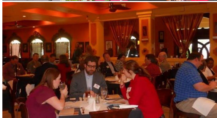
Members enjoyed a great lunch and networking.