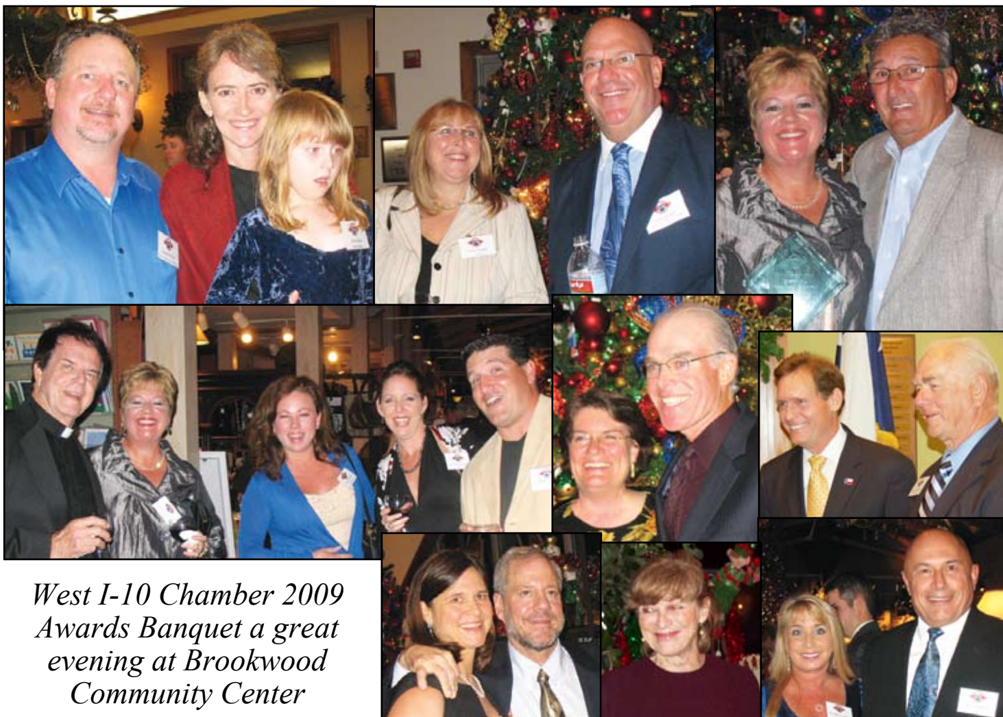
West I-10 Chamber 2009 Awards Banquet a great evening at Brookwood Community Center